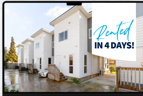
3/47 York Street, Hamilton East