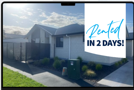
1/36 Enderley Avenue, Enderley

In today's dynamic rental market, proactive property management has never been more important. At Harcourts Hamilton Rentals, we're proud to be leading the way, currently holding an impressive 54.76% online market share, outperforming all other local agencies. Our results speak for themselves: when we say "Get Rented Faster," we actually do. Properties under our management are consistently leased within days of being listed, reflecting our commitment to efficiency, communication, and outstanding client outcomes.